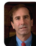
Harry Markopolos, CFA