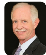
Chesley B. "Sully" Sullenberger, III